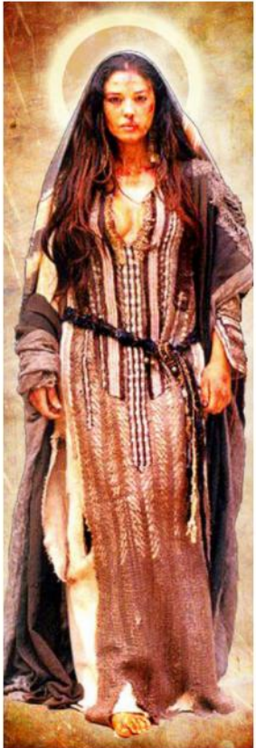
St. Mary Magdalene Apostle Feast day - July 22nd